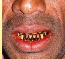
Smelly Breath, Dirty Teeth